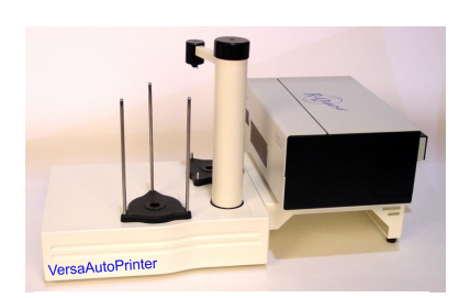
Flashjet inkjet printer shown

VersaAutoPrinter provides a very affordable automated print only system. The robust Center-Pick autoloading mechanism has provided hundreds of our customers with ease of use and trouble-free operation. The VersaAutoPrinter components are based on industrial design technology that will provide years of trouble-free operation.